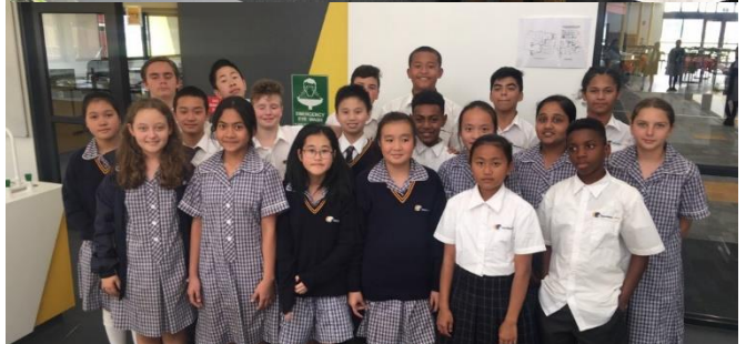
Pictured (from top): Our newest students in 7A, 7B and 7C.