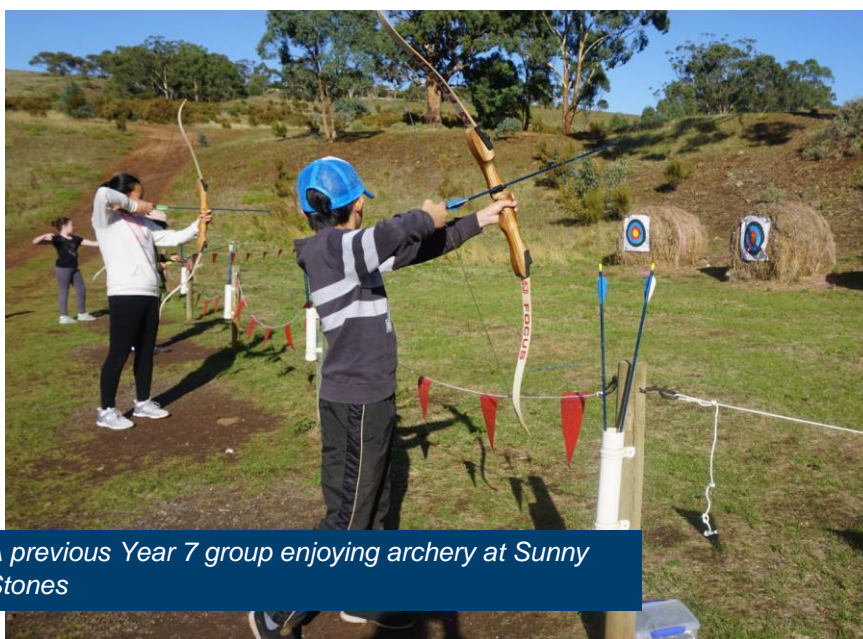
A previous Year 7 group enjoying archery at Sunny Stones

Students take part in team building exercises and will use it to build relationships as they get to know each other. Further details will be distributed in the coming weeks.