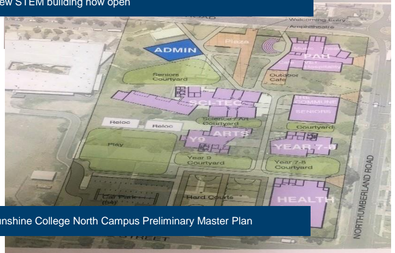
Sunshine College North Campus Preliminary Master Plan