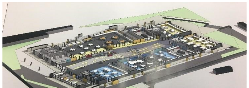
New STEM building now open

We are very excited that the construction of the STEM (Science, Technology, Engineering and Maths) Building at the North Campus is now complete and has been fully operational for the last 6 months. Our Gym/Hall has undergone a modernisation of facilities. The North Campus is part of a staged rebuilding program and has had the Preliminary Master Plan approved.