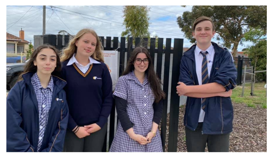
Students helping with the West Campus picnic