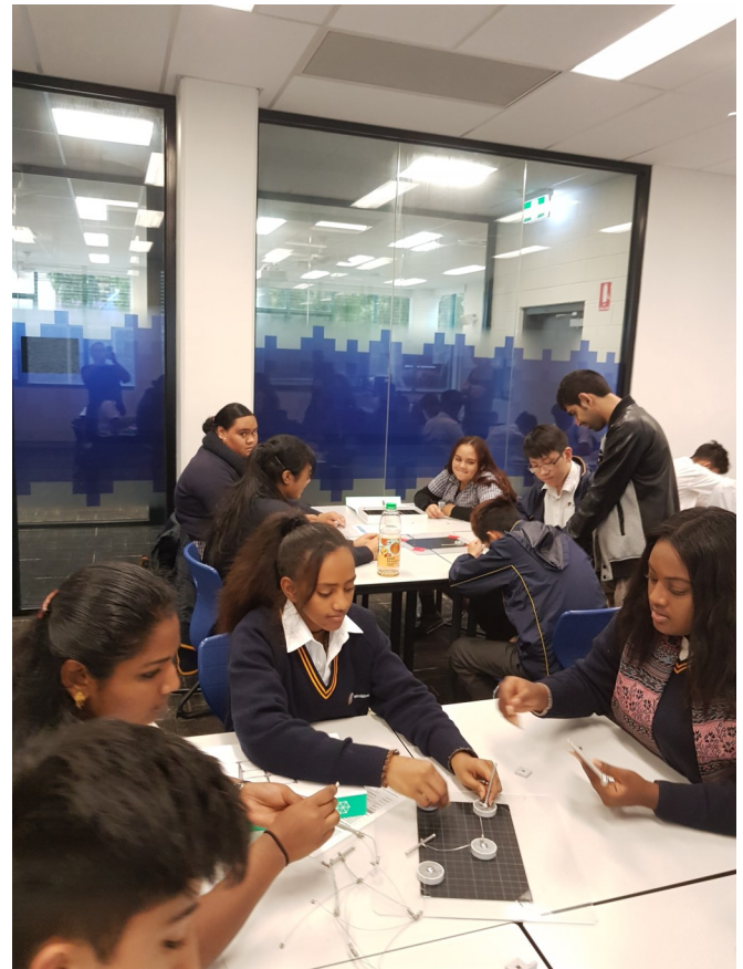
Year 10 students at the Deakin University excursion