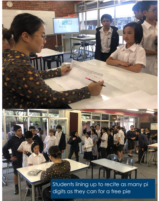
Students lining up to recite as many pi digits as they can for a free pie

As with all new systems, if you are experiencing any issues or have any questions, please contact the school's office and we will be more than happy to help you.