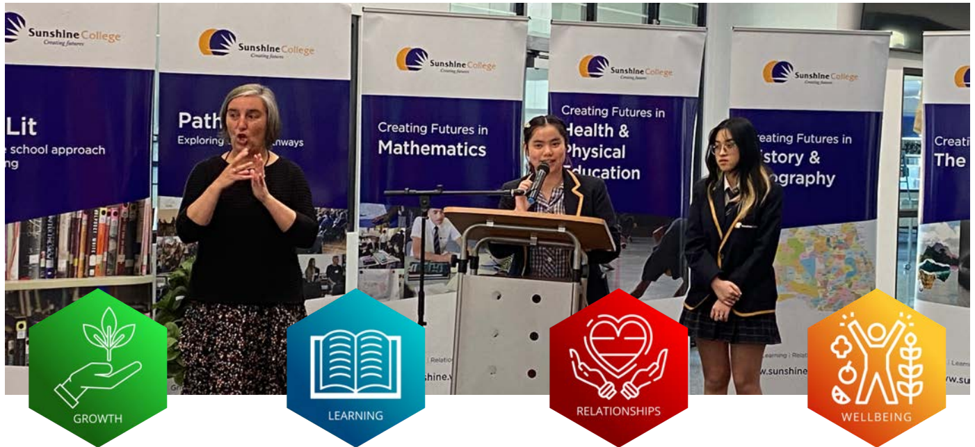
Photo: Year 12 graduation presentation