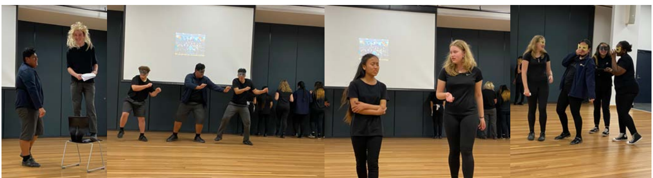
Photos: Year 9 & 10 Drama production of Romeo and Juliet at West Campus

I look forward to working closely with the Student Engagement team in supporting all students and helping them achieve their goals in 2022. On behalf of all staff at Sunshine College I wish all students and families safe and happy holidays.