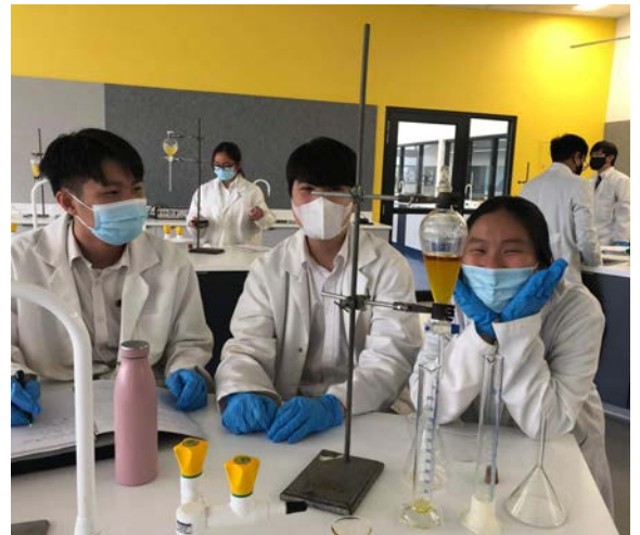
Photos: This term at Sunshine College - follow us on Facebook to see more!